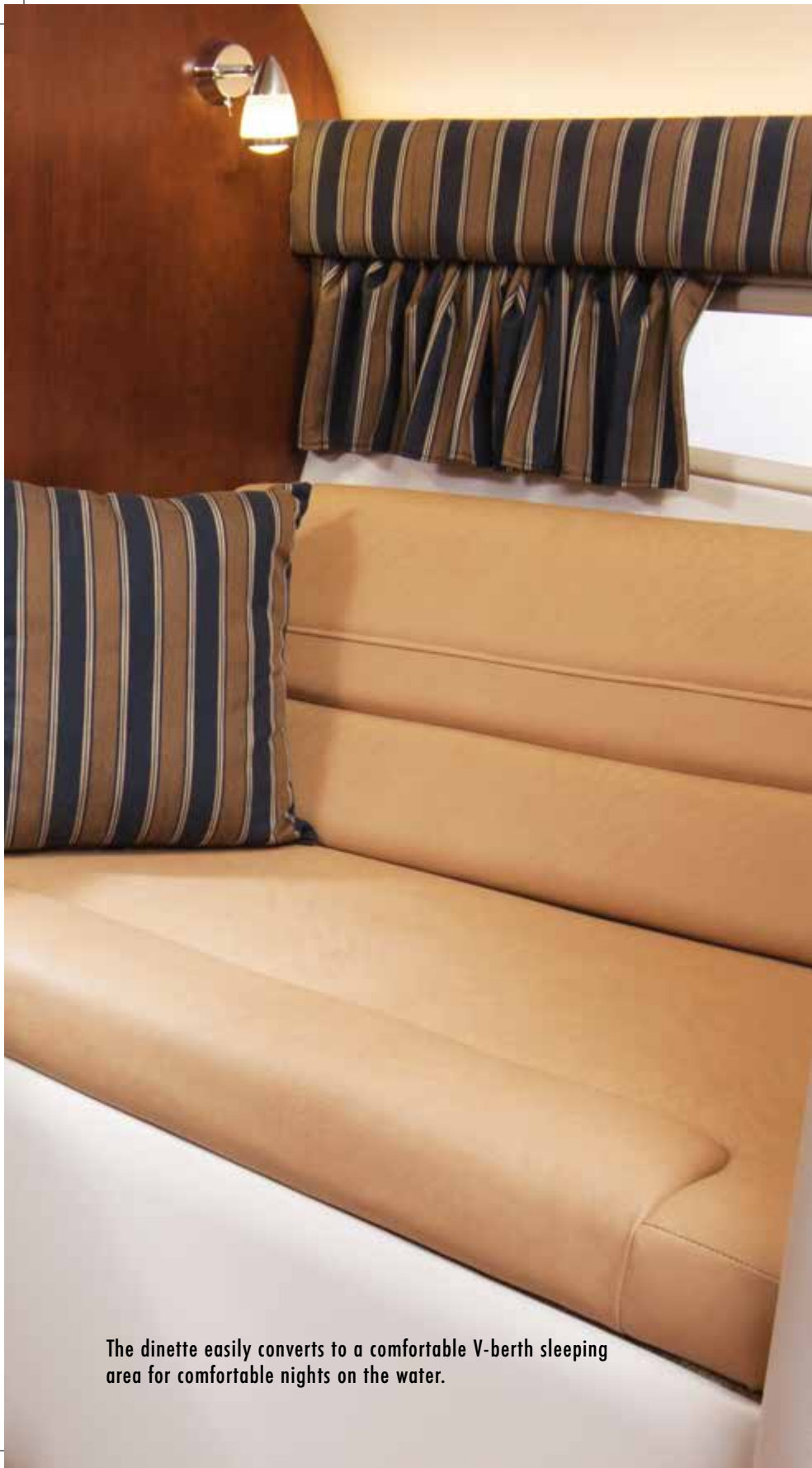
The dinette easily converts to a comfortable V-berth sleeping area for comfortable nights on the water.