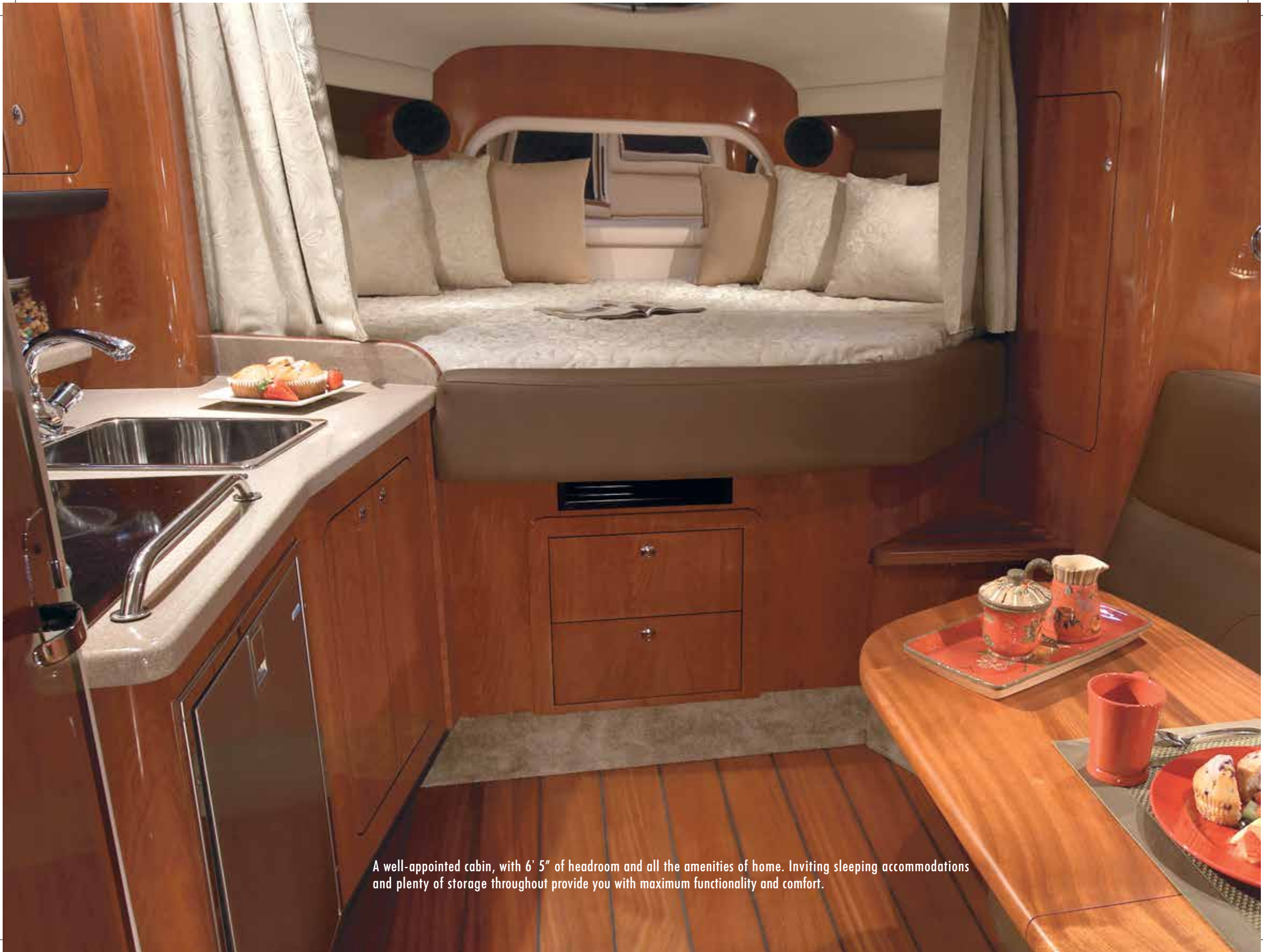
A well-appointed cabin, with 6' 5" of headroom and all the amenities of home. Inviting sleeping accommodations and plenty of storage throughout provide you with maximum functionality and comfort.