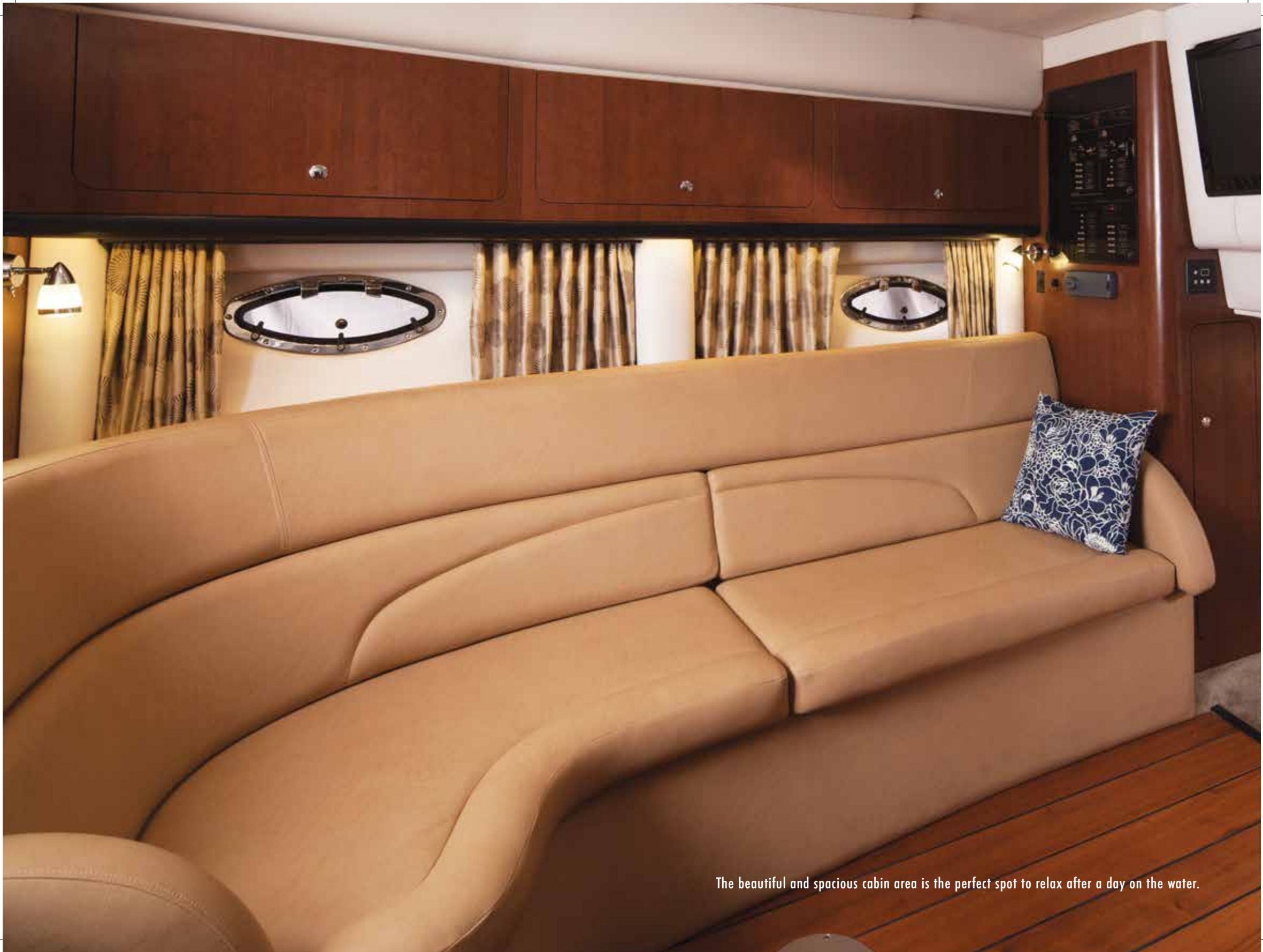
The beautiful and spacious cabin area is the perfect spot to relax after a day on the water.