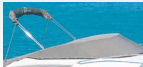
Standard Cockpit Cover & Bimini Top Stowed