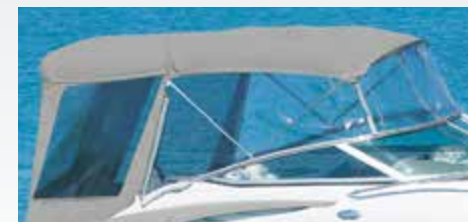
Standard Camper Canvas