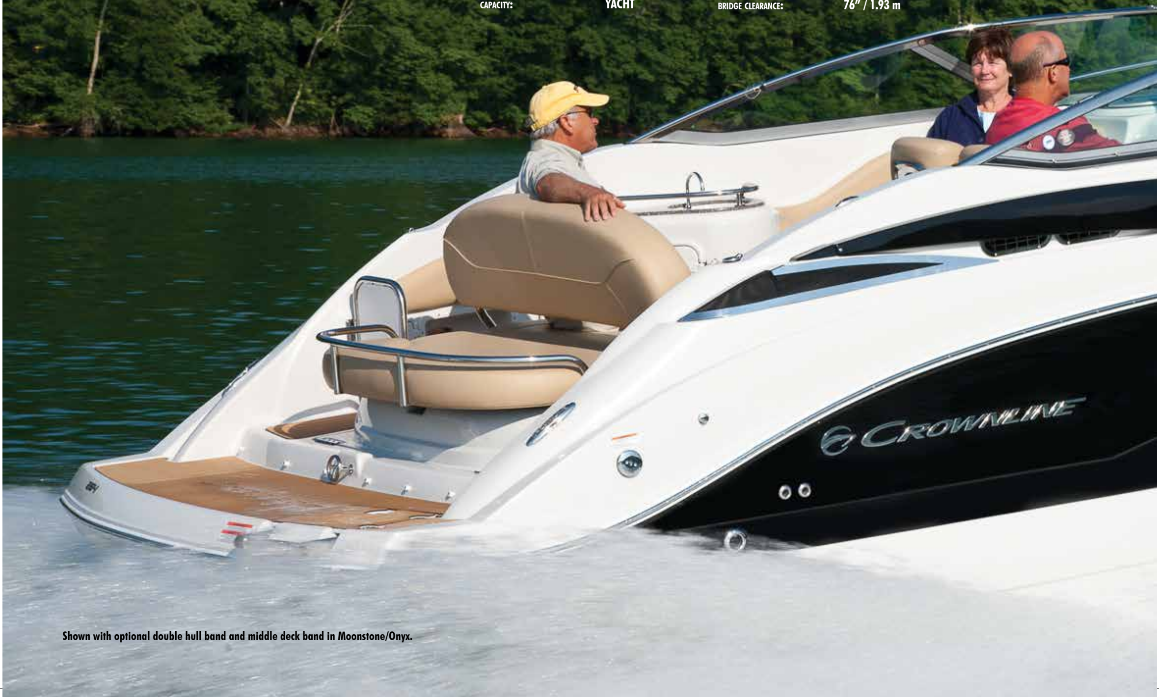
Shown with optional double hull band and middle deck band in Moonstone/Onyx.

DRY WEIGHT: 6600 – 6995 LBS / 2995 – 3173 kg DRAFT UP: 23" / 58 cm DRAFT DOWN: 38" / 97 cm DEADRISE: 18° ANGLE OF ENTRY AT BOW: 37° BRIDGE CLEARANCE: 76" / 1.93 m