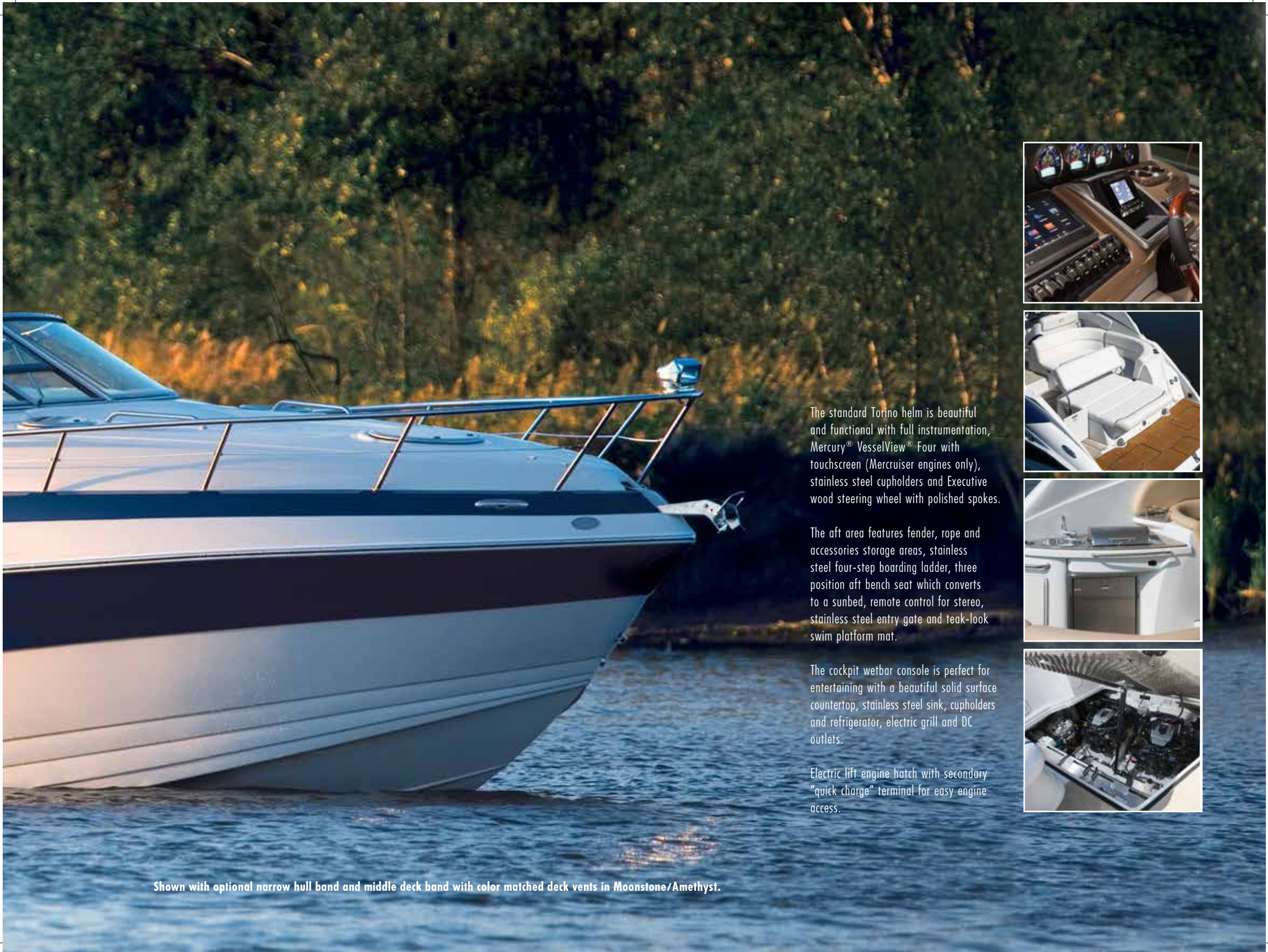
Shown with optional narrow hull band and middle deck band with color matched deck vents in Moonstone/Amethyst.