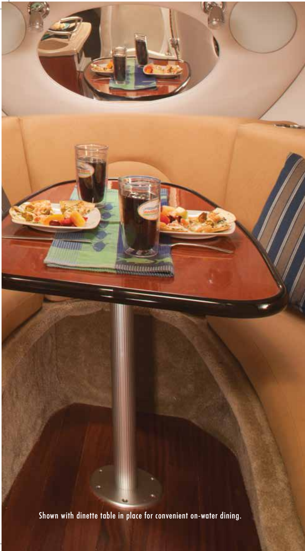
Shown with dinette table in place for convenient on-water dining.