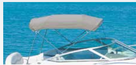
Standard Bimini Top