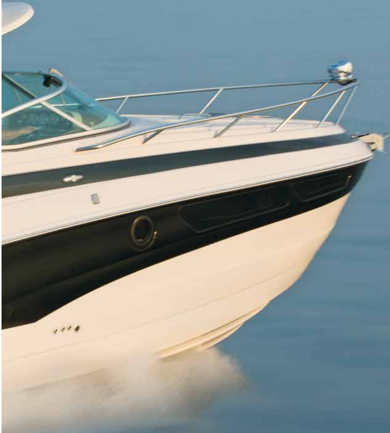
Shown with standard double hull band and middle deck band in Moonstone/Onyx.